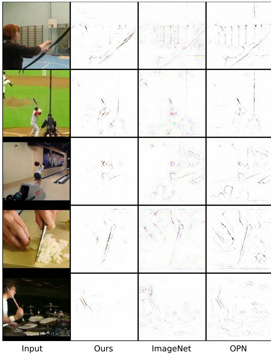
Fig. 3. Comparison of the input activations for different models. The first column represents the input sample, second is our RGB-network, third is an ImageNet pretrained network and lastly OPN [21]. The activation are computed using guided backpropagation [35]. In contrast to the other approaches our network is able to identify meaningful objects (Bow, bowling ball, drumstick ...) while also ignoring irrelevant background content