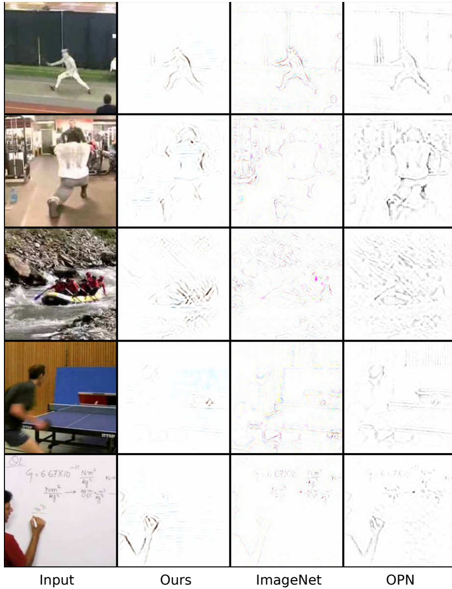
Fig. 4. Additional input activations for our RGB-network, ImageNet pretraining and OPN [21]. Our network is also capable of identifying small moving objects (table tennis ball, pen), and ignore most of the background